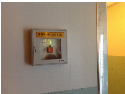
Smoke extraction activation button