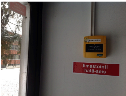
Air-conditioning emergency stop button

Emergency stop switch location At the outside doors of the staircases