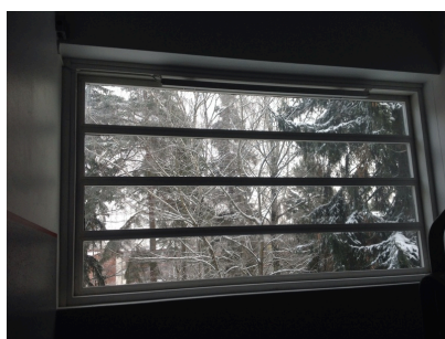
Smoke extraction window