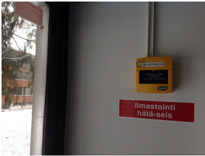
Air-conditioning emergency stop button