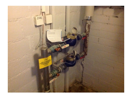
The main water stopcock

Back-up gathering area The neighbouring property