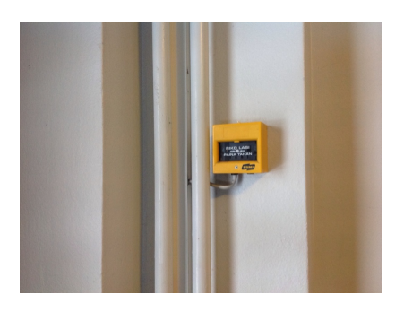
Air-conditioning emergency stop button