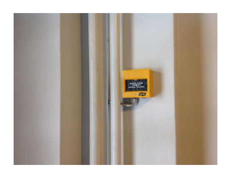
Air-conditioning emergency stop button

Ventilation emergency stop: Next to the outer door of the staircase