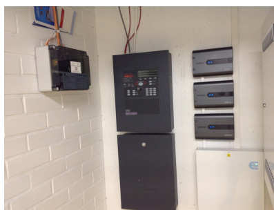
Palovaroitinkeskus ja savunpoistokeskus