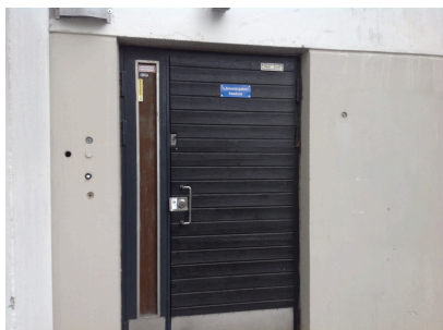
Käynti lämmönjakohuoneeseen ja veden pääsululle