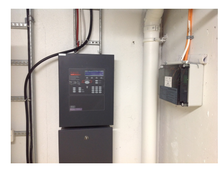
Palovaroitinkeskus ja savunpoistokeskus