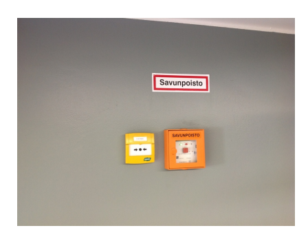
IV-hätäseis ja savunpoiston laukaisu

Ventilation emergency stop: Porraskäytävien katutasossa, sisäänkäynnin yhteydessä