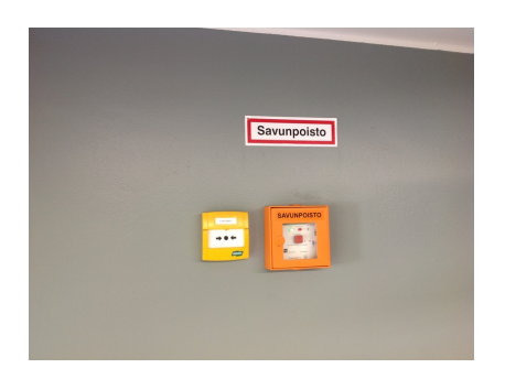
IV-hätäseis ja savunpoiston laukaisu

Porraskäytävien katutasossa, sisäänkäynnin yhteydessä