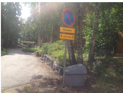
Pelastustie ja nostopaikat merkitty kilvin