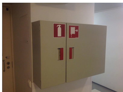
Käsisammutin ja pikapaloposti