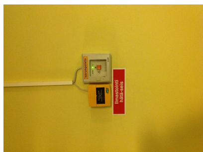
Savunpoistolaitteiston ja ilmanvaihdon laukaisu painikkeet