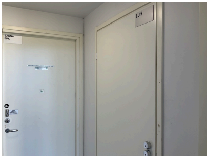
Lämmönjakohuoneen ovi asunto 2 viereisen sisäänkäynnistä oikealla. Sähköpääkeskuksen ovi suoraan ovesta.