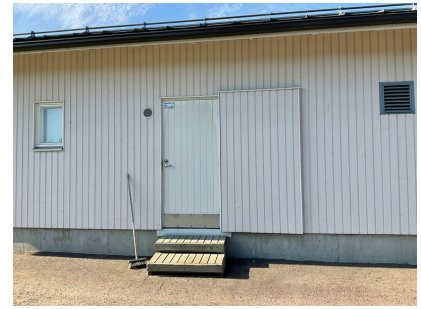
Väestönsuojan sisäänkäynti pihavarastoon 1-3