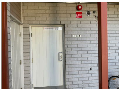
Kulku teknisiin tiloihin ja palovaroitinkeskukselle. Kuvassa myös pihan palosireeni ja put-