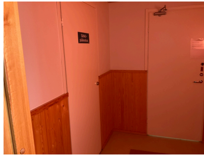
Sähköpääkeskuksen ovi saunassa