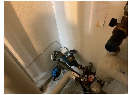
Veden pääsulku lämmönjakohuoneessa