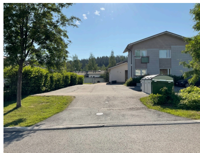
Pelastustien sisäänajo Helkan- tieltä