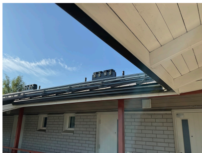
Ilmanvaihtokoneen puhaltimet katolla