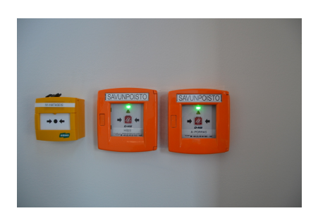
Smoke ventilation can be triggered at the main door