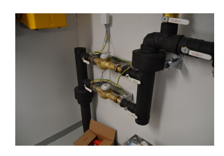
Main water cut-off valve