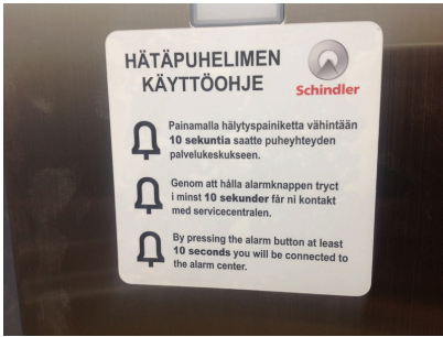
Elevator emergency phone instructions