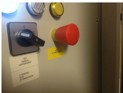
Air-conditioning emergency stop