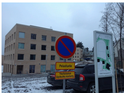
Rescue route from Maakaari