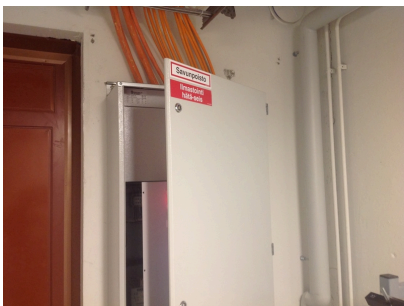
Smoke extraction panel