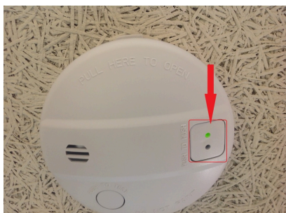
Fire alarm mute button