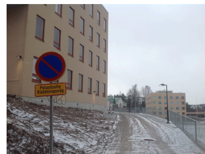
Rescue route from Tilanhoitajankaari