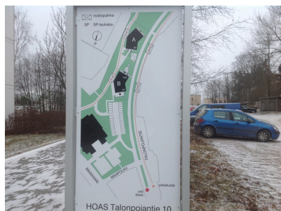
Rescue route from the direction of Talonpoijantie