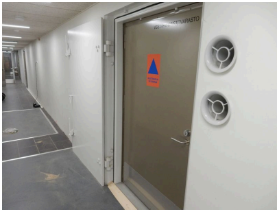
Civil defence shelter