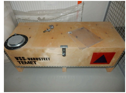
The equipment of the civil defence shelter