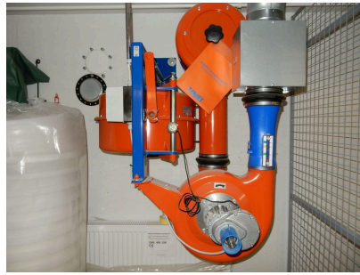
The air-conditioning equipment of the civil defence shelter