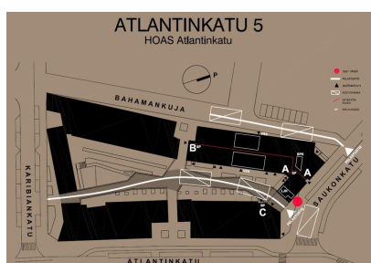
Rescue route diagram