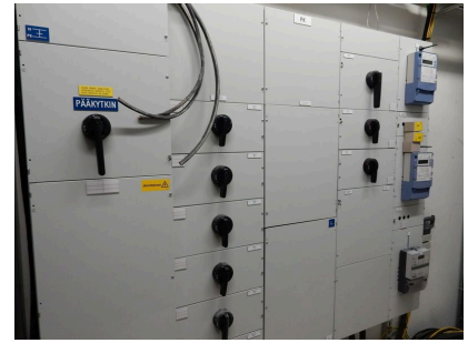
Main electricity switchboard