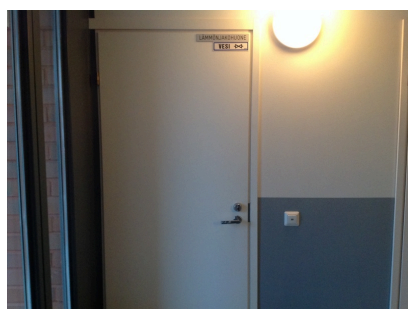
Heat distribution room in staircase C