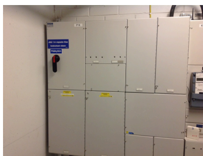
Main electrical switchboard in staircase C