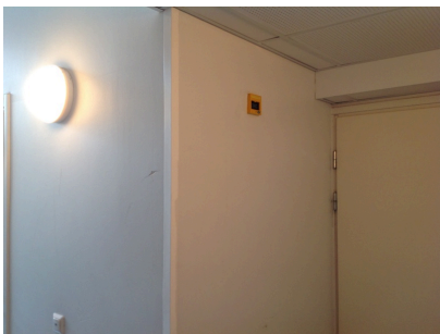
Air-conditioning emergency stop in the staircases

Ventilation emergency stop: On the ground floor of the staircases