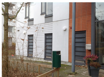
Technical areas in building A