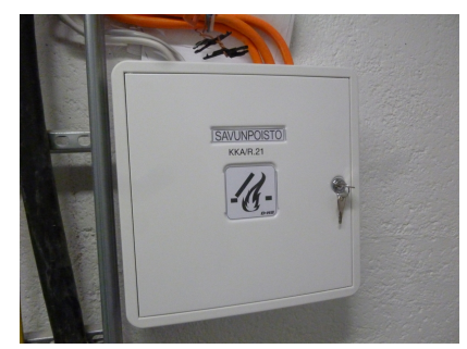
Smoke extraction panel