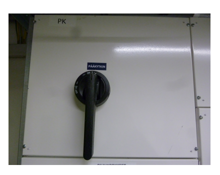
3rd main power switch