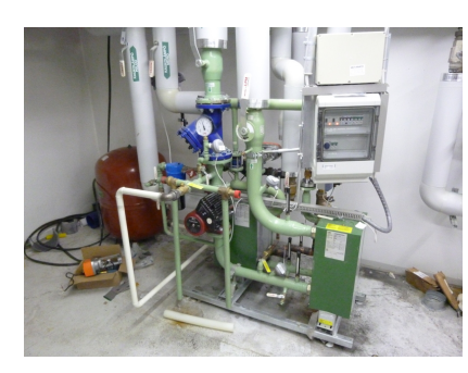
Heat distribution room 2