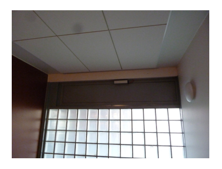
Smoke extraction hatch