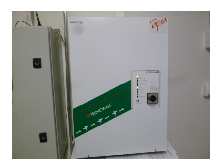
Safety light panel