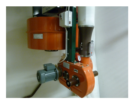
The air-conditioning apparatus of civil defence shelter 2