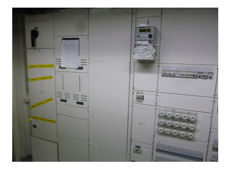
2nd electricity switchboard