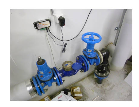
Main water stopcock 3