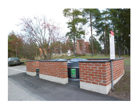
Waste disposal point

Location Waste disposal point behind the building, along Jämeräntaival