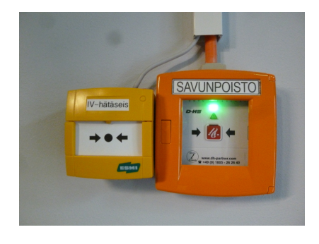
AC emergency shutoff and smoke extraction trigger