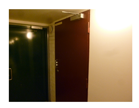
Heat distribution room 1, door