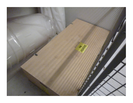
The equipment of civil defence shelter 3