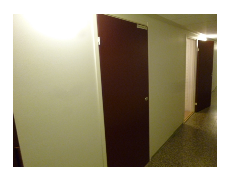
The door of main electrical switchboard 1