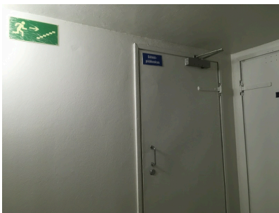
Käynti teknisiin tiloihin opastettu