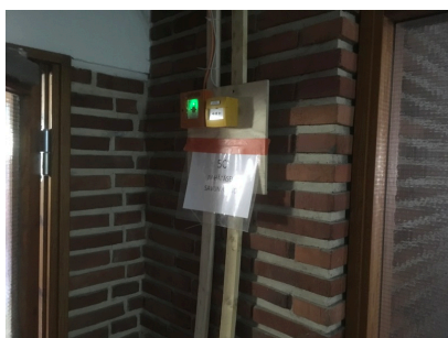
IV-hätäseis ja savunpoiston laukaisu

Ventilation emergency stop: Heat distribution room