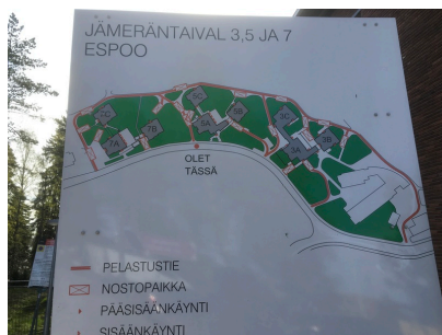
Pelastustiet merkitty alueo- pasteeseen