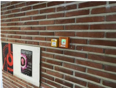
activation of IV-emergency stop and smoke extraction

Ventilation emergency stop: At the entrances of the staircase corridors