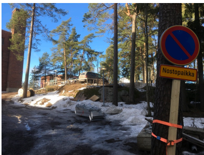
Lifting places marked

Location To entrances from Jämeräntaipale, pick-up points are marked