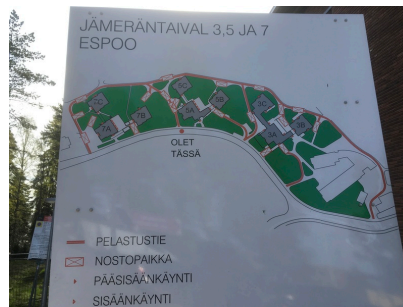
Rescue routes marked in the area signs