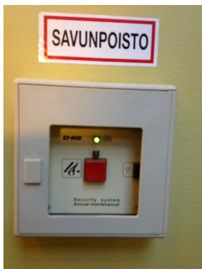
Smoke venting triggering