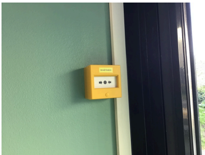
Ilmanvaihdon hätä-seis-painikkeet porrashuoneiden pääsisäänkäynneillä

Ventilation emergency stop: Porrashuoneiden pääsisäänkäynnillä