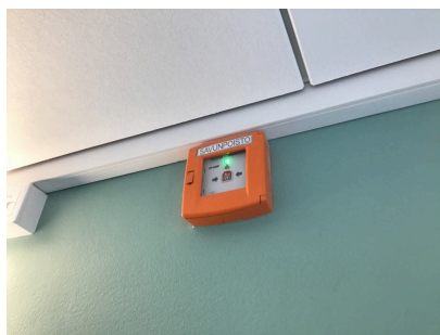
Porrashuoneen savunpoiston etälaukaisu porrashuoneiden pääsisäänkäynnillä