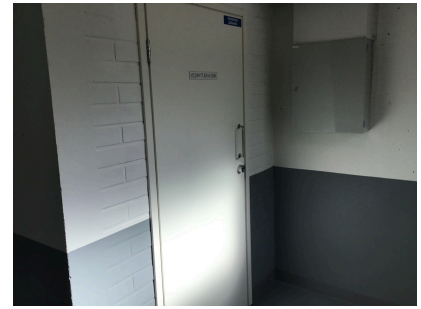
Kulku veden pääsululle