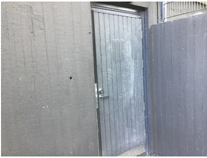
Kulku lämmönjakohuoneeseen ja kohteen putkilukko